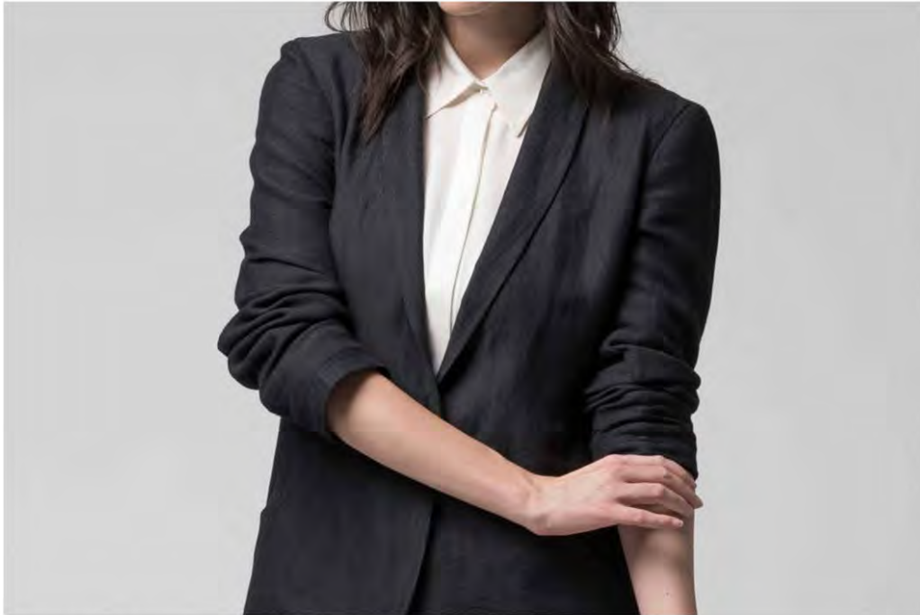
The Art of the Gentlewoman Slouch Blazer ($280)

BY TIFFANY YANNETTA | MAR 13, 2017, 2:02PM EDT